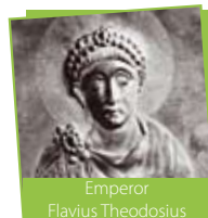
Emperor Flavius Theodosius

The wonderful effects of the water were also known by our ancestors. According to archaeological excavations people lived here even at the end of the Stone Age. The Romans laid the foundations for bath culture in the 2 nd century. They bathed in warm and cold water pools in the building of "Villa Rustica", which was excavated in Hévíz. The first significant bath development is related to the Festetics Family at the end of the 18 th century. That time was the beginning of scientifically using the water of Hévíz and medically examining its healing effects.