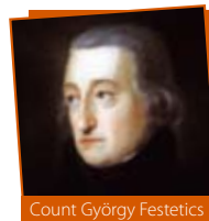
Count György Festetics